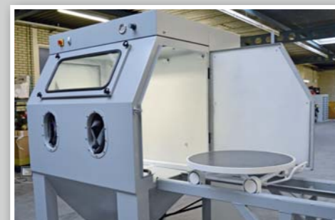
OPTION 1: Turntable with rail system