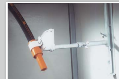
OPTION 3: Fixed blast gun holder