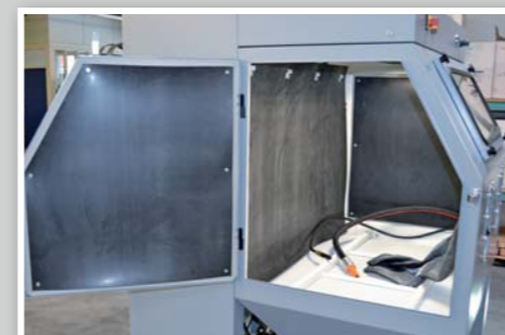
OPTION 2: Rubber protective lining, inside cabinet