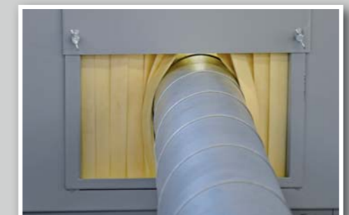
OPTION 4: Door tunnel for longer products