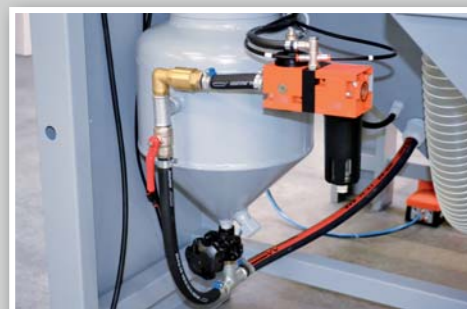
Blast pot MP